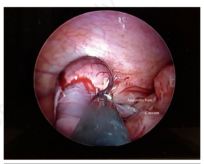
Figure 2. Normal appendix base 1.5 cm distal to the site of torsion.