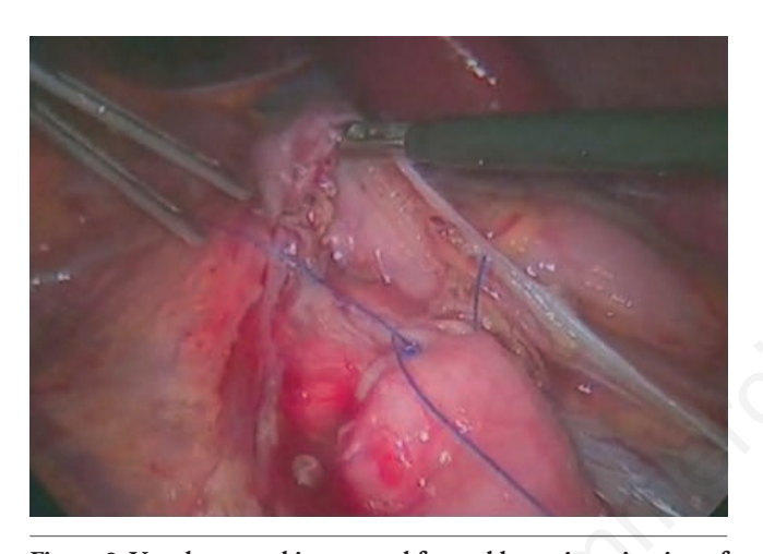
Figure 3. Vessels sutured in a tunnel formed by an invagination of the anterior pelvic with two interrupted 4/0-polydioxanone absorbable sutures.

In children UPJO is the more frequent pathology associated to HSK. UPJ in fact, is located higher than normal. This situation can possibly result in UPJ obstruction of various degrees. The ureter